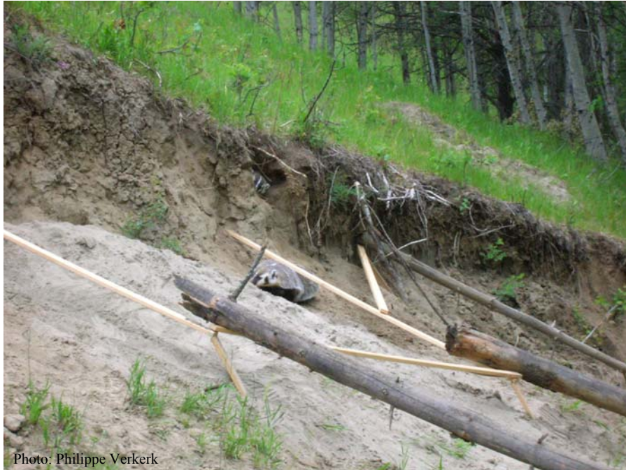
Photo 2. Perimeter snag set at a maternal burrow with Badger moving under the pinned-knaplock.