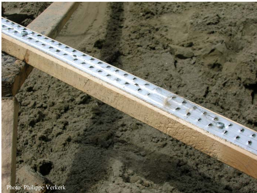
Photo 3. Pinned-knaplock lining underside of perimeter snag with hair sample.