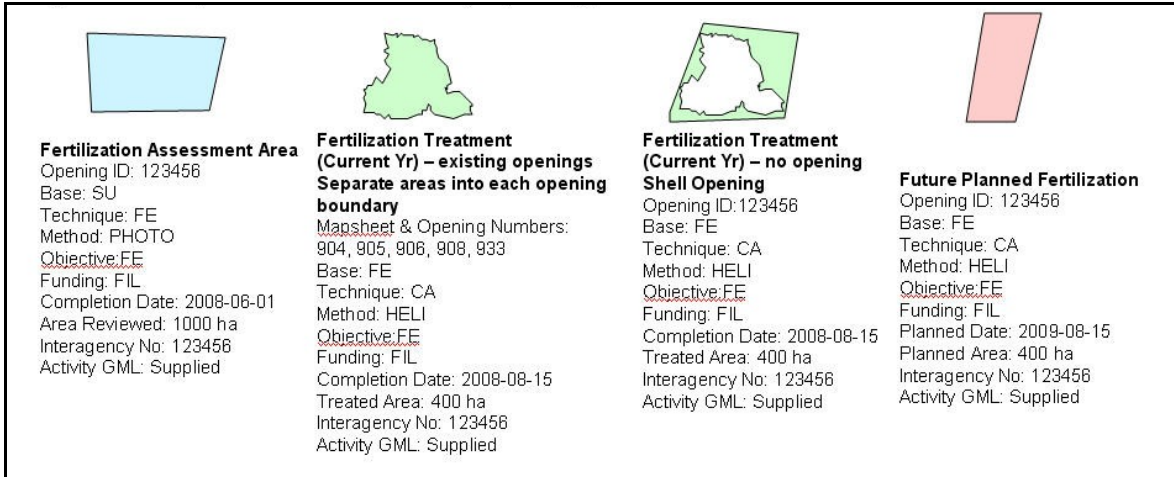
Figure 2 Option 1: Separate Submission by Openings