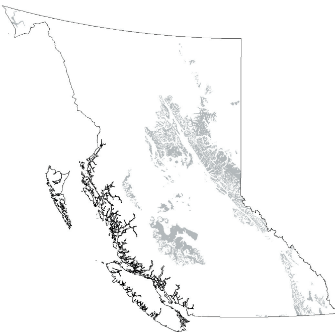
FIGURE A2.1 Shaded areas indicate the location and extent of the BEC subzones and variants for which data are sparse (listed above). Estimates exist for the remaining BEC subzones and variants, from either the first or second approximation SIBEC estimates.