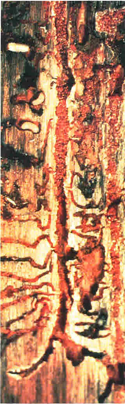
Figure 6 —Bark beetle galleries form an identifying pattern. Mountain pine beetle egg galleries are vertical. The larvae construct their feeding galleries at right angles to the egg galleries.