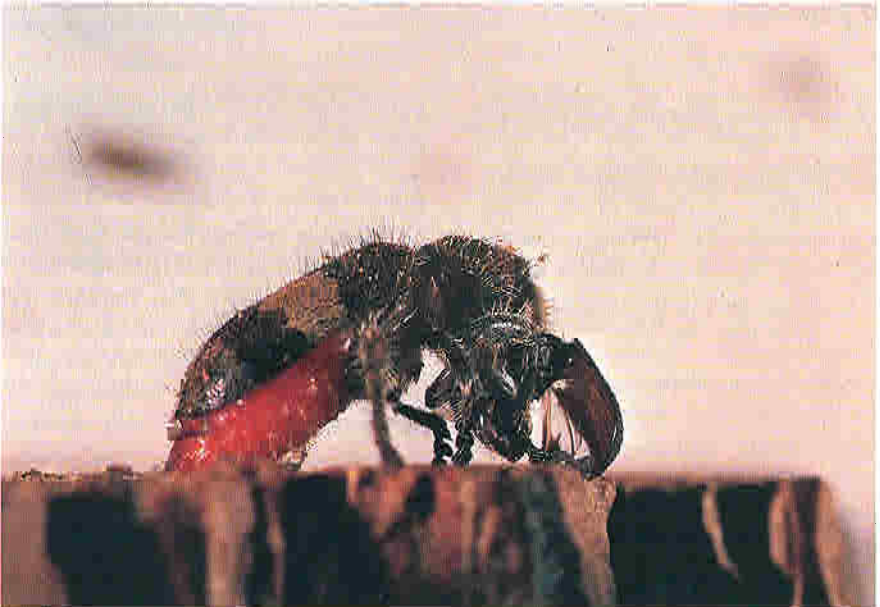
Figure 8 —A checkered beetle ( Enoclerus spegeus Fabricius) eating a mountain pine beetle adult.

A dolichopodid fly and two species of checkered beetles (fig. 8) are common predators: they may reduce beetle numbers in individual trees but seldom affect mountain pine beetle infestations. Parasitic wasps sometimes cause substantial mortality in trees where their short ovipositors can reach the larvae through the thin bark.