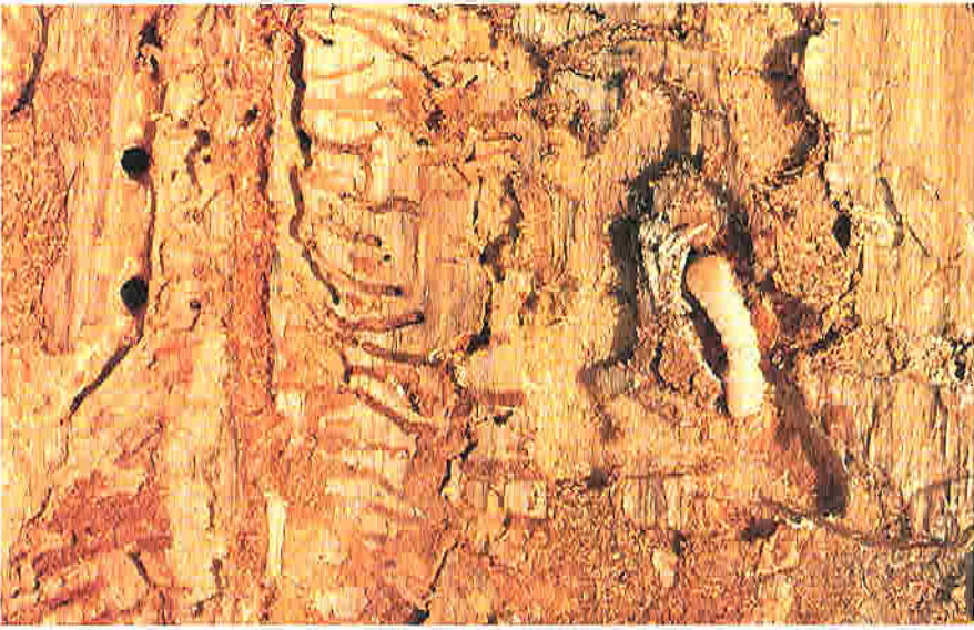
Figure 9 —Larvae of the round-headed woodborer (see larva near top of photo) have devoured both the phloem and the mountain pine beetle brood.

Competition. Larvae compete for food and space not only with each other but with larvae of other beetles. For example, the larvae of the round-headed woodborers, feeding within the inner bark, occasionally destroy almost all of the mountain pine beetle brood found there (fig. 9).