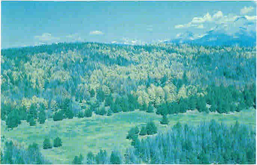
Figure 10 — High-risk ponderosa pine stands attacked by the beetle. Trees with yellow foliage have been recently attacked; gray trees were killed the year before the trees with yellow foliage were attacked.

High-risk lodgepole pine stands have an average age of more than 80, an average diameter at breast height of more than 8 inches (20 cm), and a suitable climate for beetle development based on elevation and latitude.