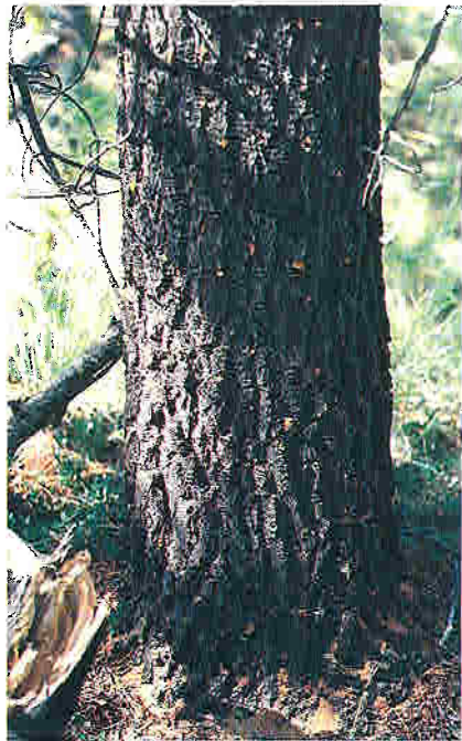
Figure 3 —Pitch tubes on the trunk and boring dust around the base indicate that this lodgepole pine has been attacked and killed by the beetle.