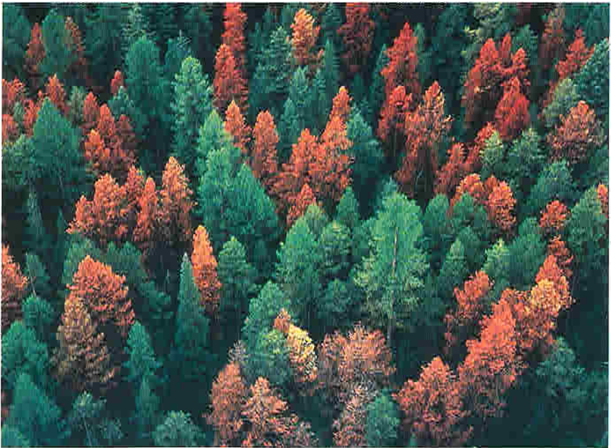
Figure 5 —Dying trees. Discolored foliage is a sign that these lodgepole pines have been attacked and killed by the mountain pine beetle.