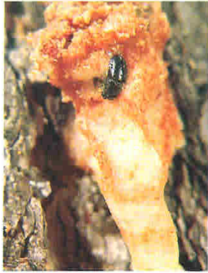
Figure 2 —Unsuccessfully attacked tree has “pitched out” beetle.

Besides having pitch tubes, successfully infested trees will have dry boring dust, similar to fine sawdust, in bark crevices and around the base of the tree (fig. 3). Sometimes, however, infested trees can have boring dust, but not pitch tubes. These trees, called blind attacks, are common during drought years when trees produce little pitch.