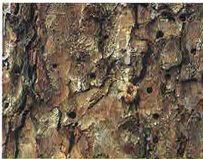
Figure 7 —Exit holes, about 3/32 inch (2.4 mm) in diameter, made by mountain pine beetles.

Adults feed within the bark before they emerge; when several feeding chambers coalesce, adults occur in groups. One or more beetles will then make an exit hole (fig. 7) from which several adults will emerge. Within 1 or 2 days after emerging, the beetles will attack other trees.