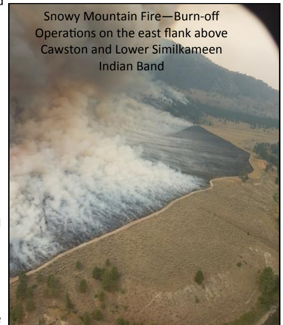
Snowy Mountain Fire—Burn-off Operations on the east flank above Cawston and Lower Similkameen Indian Band