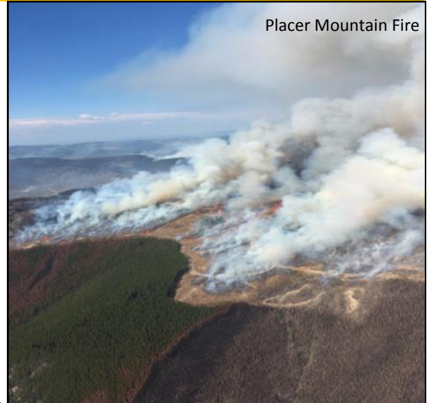
Placer Mountain Fire

Objectives: Crews worked overnight on the east flank, where they saw continued fire activity. With high downslope winds, the fire spotted across the Similkameen River south of Cawston which was responded to by 25 BCWS firefighters in conjunction with the Keremeos Fire Department. Unexpected cold front activity sustained fire growth overnight, and on the south side there are northerly winds at 25 km/hr pushing the fire south. The objective for today is to strategically place crews in the operable terrain areas, where they will continue to conduct burn-offs on the southeast flank as safe conditions allow. Structural protection specialists will continue assessing and equipping properties as needed on the east flank, working south down Chopaka Road.