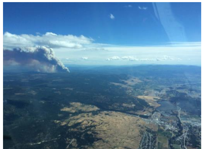
Aerial perspective of the Philpott Road wildfire.

Evacuation Order: The Central Okanagan Regional District has issued an evacuation order for the area of Joe Rich. For more information and a map of the affected area, please contact the CORD at https://www.cordemergency.ca/ .