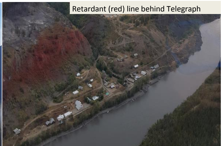
Retardant (red) line behind Telegraph