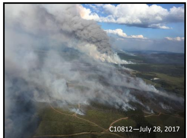
C10812—July 28, 2017