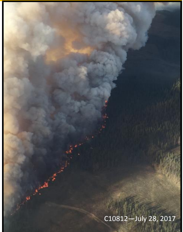
C10812—July 28, 2017

If further information is required for the fires below or any fires in the Quesnel West Complex, please email Marg Drysdale at: QuesnelWComIN@gov.bc.ca or call reception in Nazko at 250-249-9654 (please leave a message).