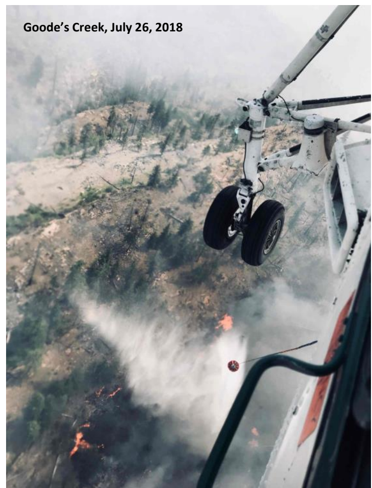
Goode's Creek, July 26, 2018

Other: This will be removed as a 'Fire of Note' on tomorrow's Situation Report.