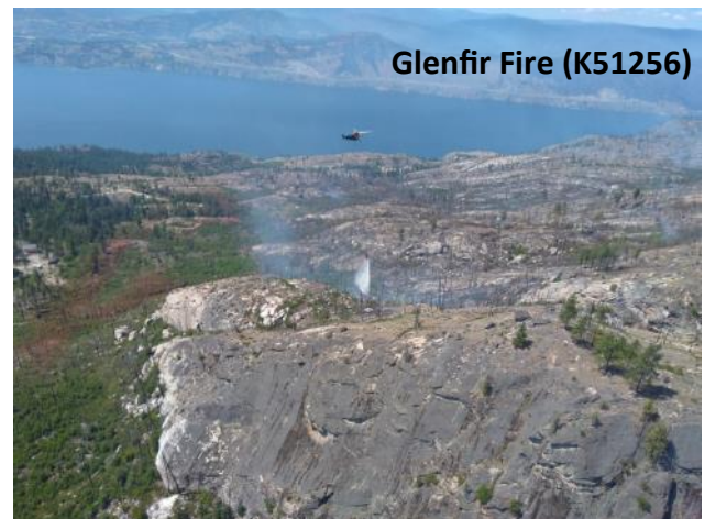
Glenfir Fire (K51256)

Other: This fire experienced an isolated shower yesterday.