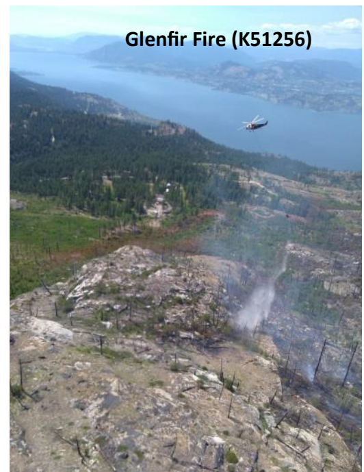
Glenfir Fire (K51256)

260 personnel are currently assigned to this Complex.