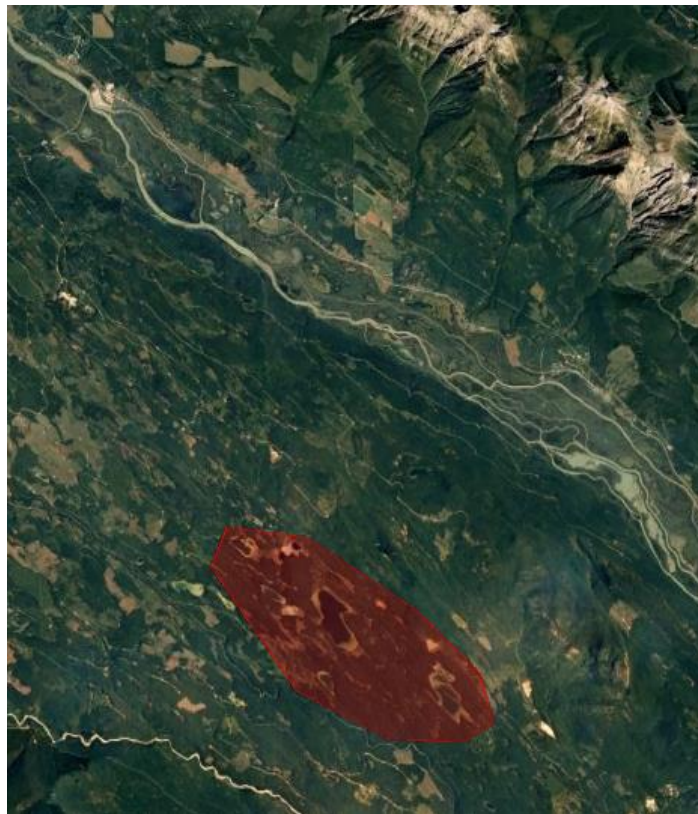
Evacuation Alert Area

The Golden and Area Emergency Management Program asks that campers and backcountry users prepare for immediate evacuation on very short notice. Be prepared for worsening conditions.