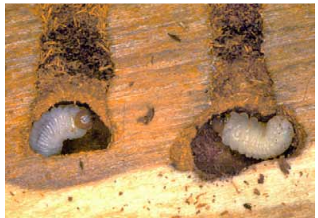
Figure 2: Douglas-fir beetle larvae.