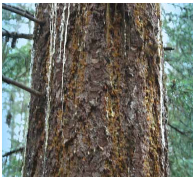
Figure 5: Sap streamers on the upper portion of a tree (sap streamers lower on a tree trunk or tree limb may have been triggered by another type of injury).