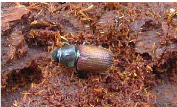
Figure 1: Adult Douglas-fir beetles are dark brown and black and are 4.5 mm to 7 mm long.

Douglas-fir beetles usually prefer to attack trees with a diameter over 20 cm, but they will attack smaller trees when the beetle population is high. They are also attracted to high stumps and slash piles.