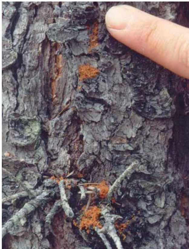
Figure 4: Frass (fine sawdust) on a tree trunk, an indication that beetles have bored into the tree.