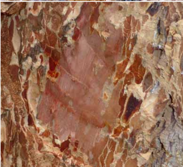
Figure 7: Brown cambium on a tree that's been attacked (which will die even if the crown is still green) and pink cambium on a healthy tree.