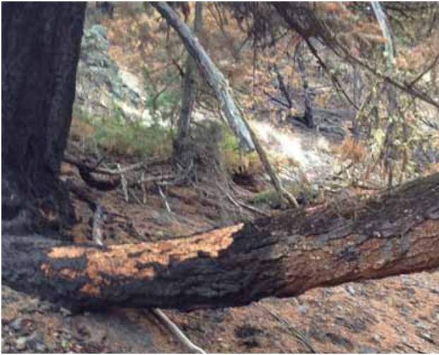
Figure 6: Damage caused by a woodpecker feeding on beetles on a fire-damaged Douglas-fir tree.