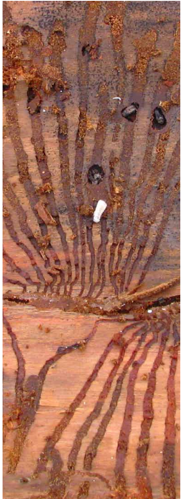
Figure 8: Douglas-fir beetle "galleries" under the bark, indicating that the tree is infested and should be removed from the property to minimize the beetles' spread the following year.