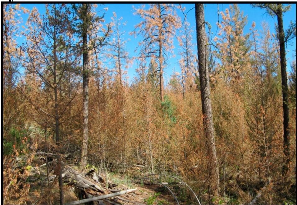
An outbreak lasts for 2-4 years, during which serious tree mortality occurs.

During an outbreak, trees may be killed in one year because the Douglas-fir tussock moth feeds voraciously on both new and old needles. Defoliated trees appear reddish in colour and by July, they take on a scorched appearance.