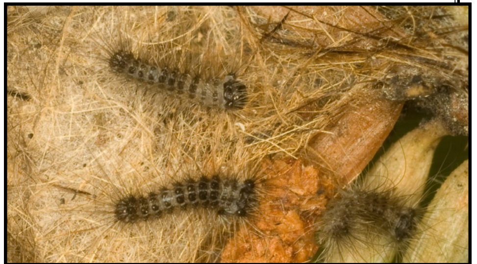
Young tussock moth caterpillars

Caterpillars hatch in late spring and feed on the current year's needles. The young caterpillars disperse by silken threads on light winds. As they mature, they feed on both old and new foliage. Mature larvae are easily identified by three long, black tufts: one located on the rear of the insect and two on the head.