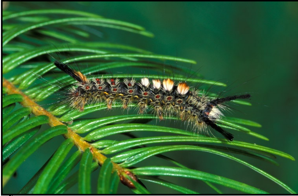
Douglas-fir tussock moth mature larva (caterpillar)

The Douglas-fir tussock moth is a native insect in the low-lying, dry belt Douglas-fir regions of southern British Columbia. This insect is both a private land and public forest issue. Outbreaks of tussock moth occur every 10-12 years and cause significant damage and mortality to Douglas-fir stands in these areas. Its primary hosts are Douglas-fir, spruce and ornamental trees in urban neighbourhoods.