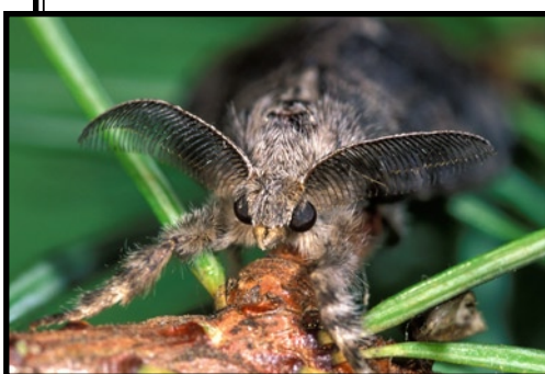
Male tussock moth

The tussock moth has a one-year life cycle and overwinters as eggs. Adults appear from late July to early September. The adult female is flightless and remains close to her cocoon. She sends out pheromones to attract male moths. Mating and egg laying occur on the cocoon. Female tussock moths lay about 200 round white eggs.