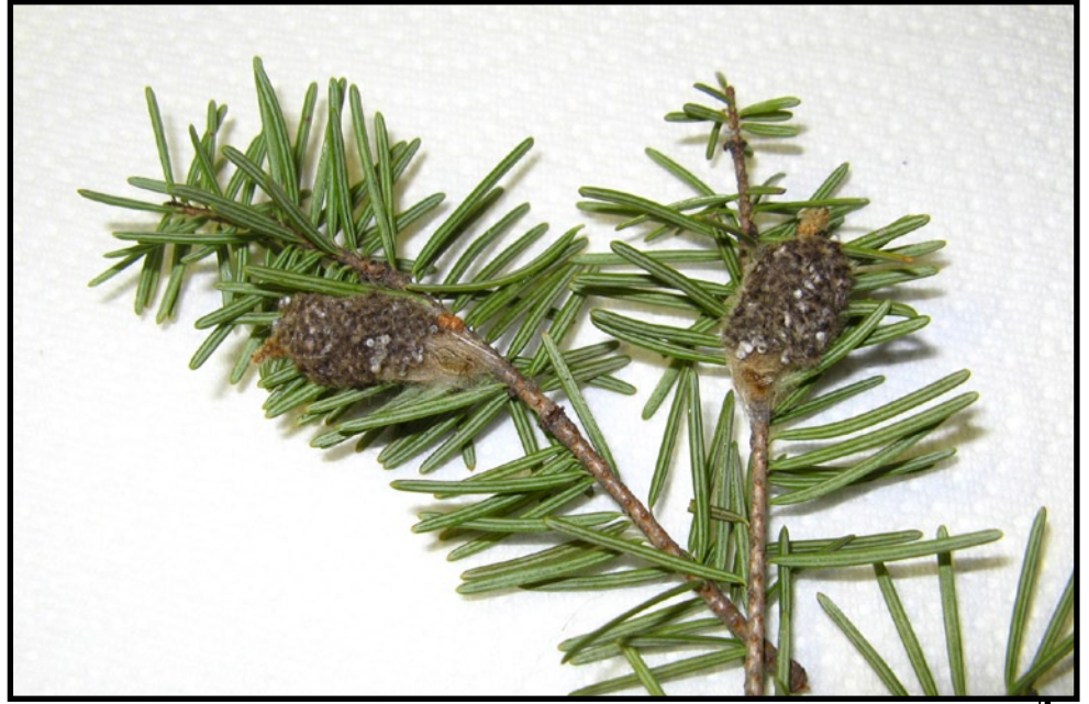
Egg mass on old cocoon

Caterpillars hatch in late spring and feed on the current year's needles. The young caterpillars disperse by silken threads on light winds. As they mature, they feed on both old and new foliage. Mature larvae are easily identified by three long, black tufts: one located on the rear of the insect and two on the head.