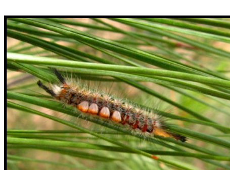
Caterpillar on pine

Tussock moths are covered in thousands of tiny hairs, which may give some people an allergic reaction, known as tussockosis. Avoid physical contact with the insects and wash after exposure. If tussockosis symptoms are severe, seek the advice of a physician.