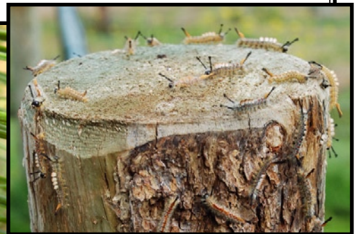
Caterpillars on old stump

For more information on Douglas-fir tussock moth and its control, please contact: