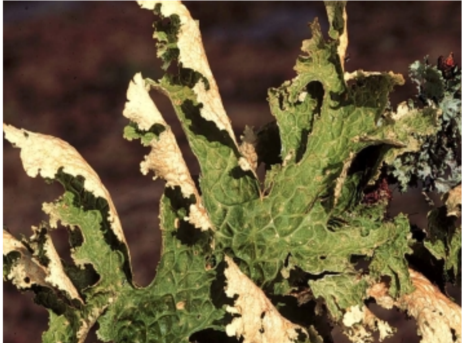
FIGURE 1. Lobaria oregana (lettuce lung).

We also assume that the greater the number of “oceanic” lichens present in a given forest stand, the older the stand. The following species appeared to be useful indicators of stand age: Cavernularia hulthenii , Fuscopannaria ahlneri , F. mediterranea , Hypogymnia apinnata , H. enteromorpha , H. oceanica , H. rugosa , H. vittata , Lichinodium canadense , Lobaria linata , L. oregana , L. retigera , L. silvae-veteris , Nephroma isidiosum , N. occultum , Platismatia norvegica , Polychidium dendriscum , Sphaerophorus globosus , S. tuckermanii , Sticta fuliginosa , S. oroborealis and S. wrightii . In general, we considered as candidates for antique status all forest stands supporting nine or more of these lichens. Even so, a few stands supporting 11 or more indicator species were rated as “possibly antique” or “not antique”, based on the absence or poor development of various other (i.e., nonlichenological) criteria of extreme old age.