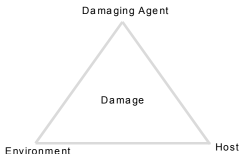
Figure 1. The disease triangle altered to account for both disease and insects.

The scientific uncertainty surrounding the specific direction of climate change, particularly regarding precipitation, has significant consequences for forest pests, their hosts and forest management in BC. Climate change will directly affect the environment which will indirectly affect the host, the damaging agents (insects or fungi) and the resulting damage (Figure 1).