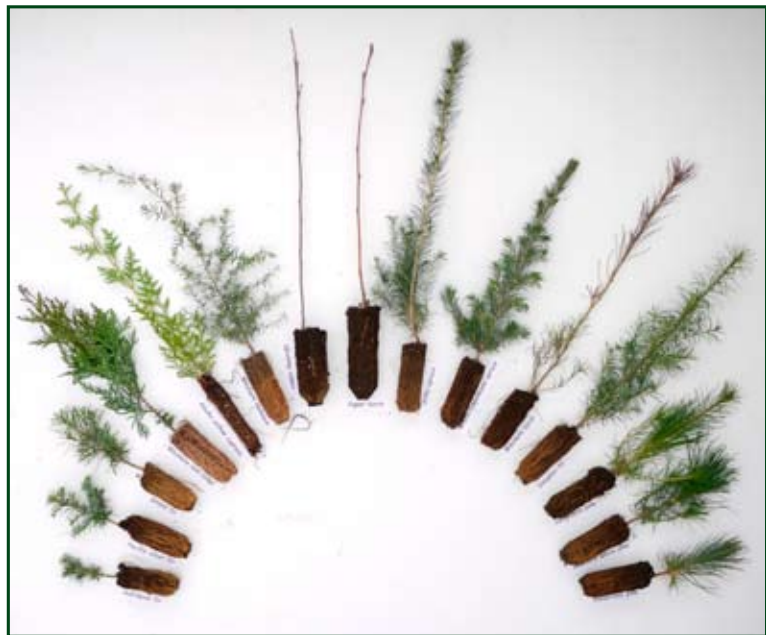
Fifteen tree species being tested in the AMAT

Forty-eight seed sources from 15 tree species originating from BC and the north-west states will be tested at 48 field test locations between central Yukon and northern California.