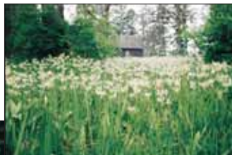
Photos: Garry oak - Common camas - White fawn lily subcommunity (above); Western trumpet (left); grassy Garry oak stand (below).