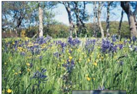
Photos: Garry oak - Common camas - Western buttercup subcommunity (above); Common camas (right).