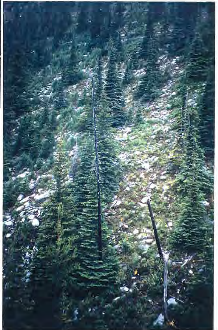
Figure 9. Upper ESSF, nearly AT, on McCabe Ridge. Showing charred snags which indicate past fire activity on these open slopes.