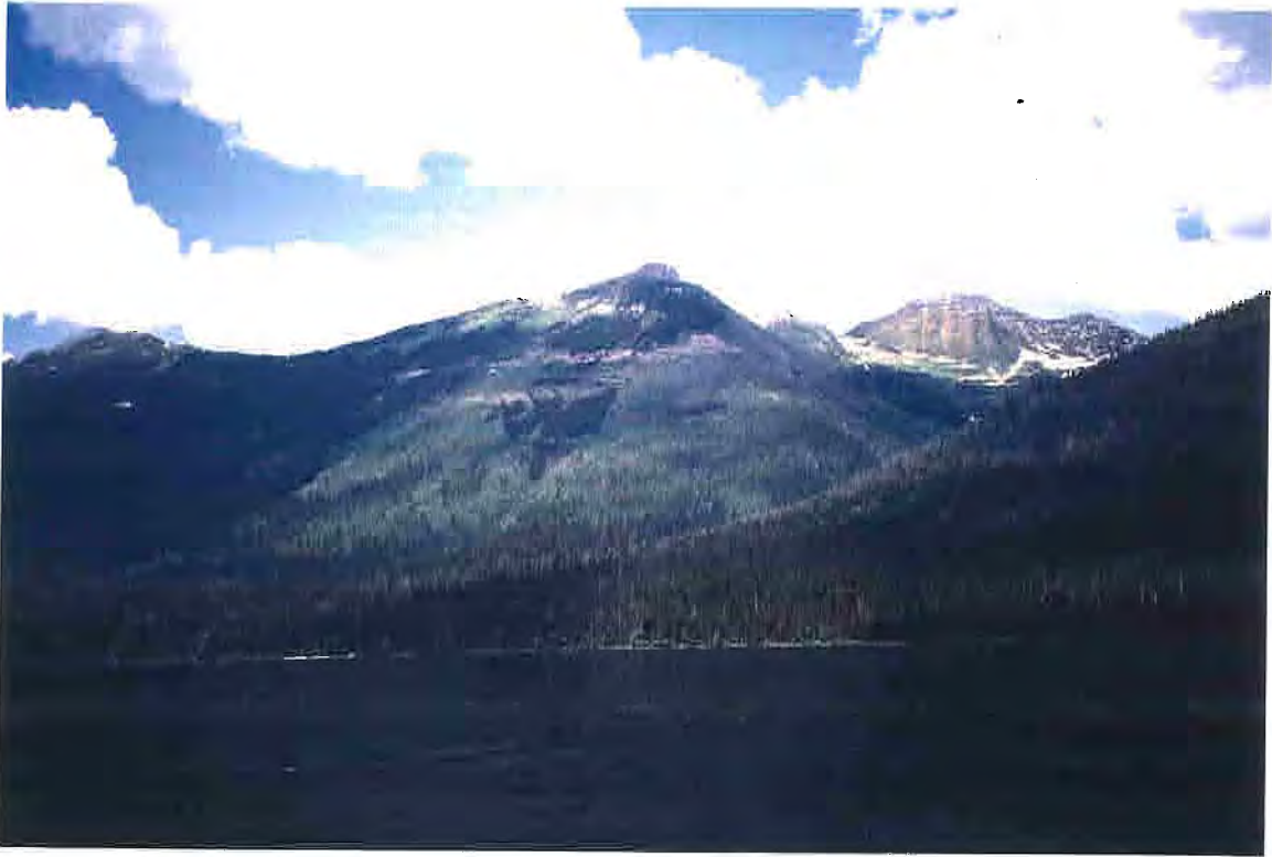
Figure 6. Wol fire of 1961 at the north end of Isaac Lake. Primarily burned in the ESSF.