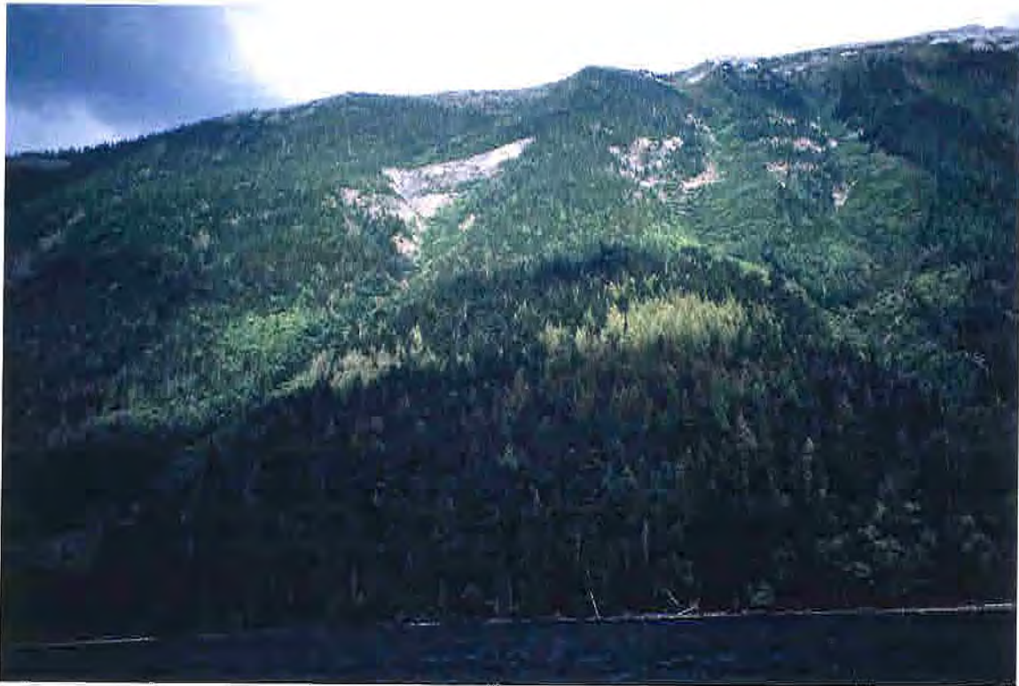
Figure 7. Older burn on the east side of Isaac Lake, below Betty Wendle Creek. Likely dating from between 1850 and 1750. Note some interaction with avalanche tracks.