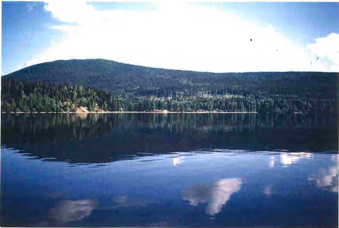
Figure 2. View to the north end of Bowron Lake - SBS at lower elevations, ESSF on ridge. Fire patterns on ridge face.