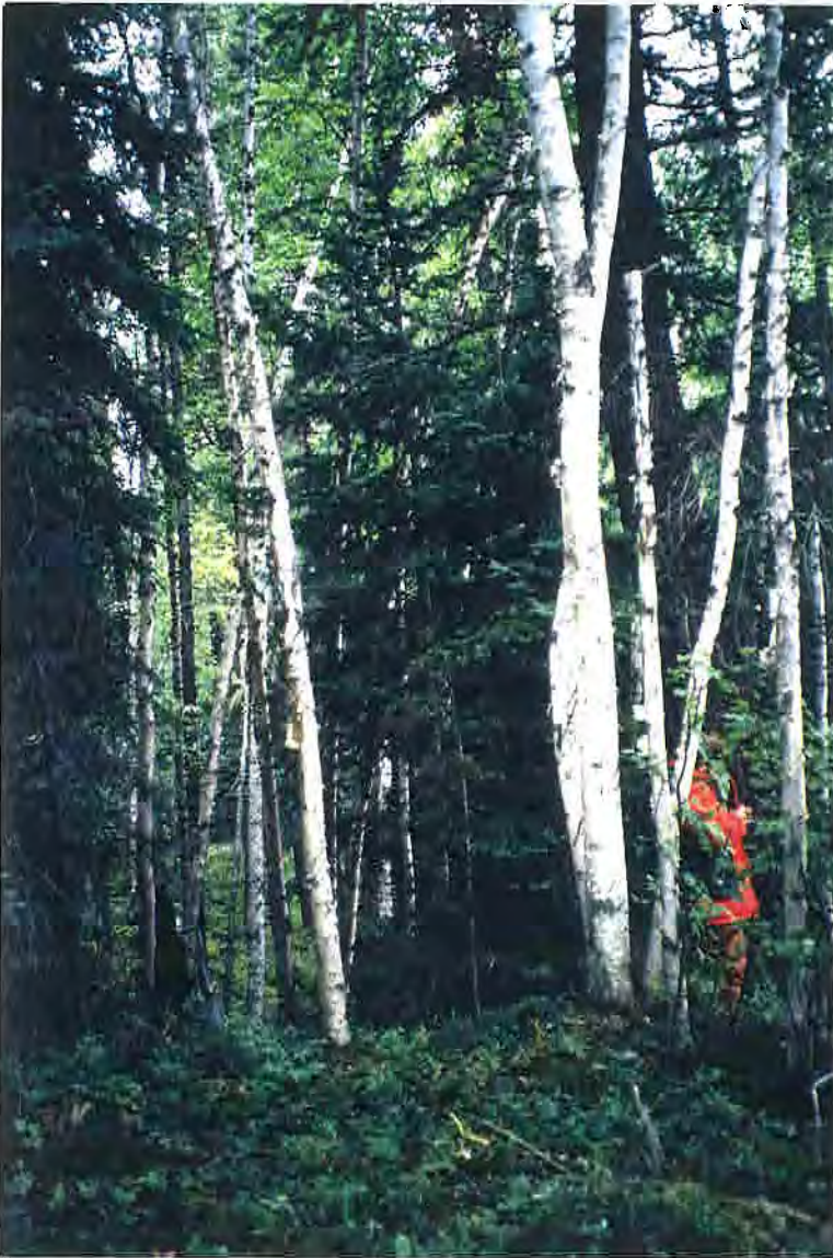
Figure 4. Two-storied stand on Iltzul Ridge, ICH zone. Veteran Douglas-fir with a mixed understory. A charred stump indicates the fire history.