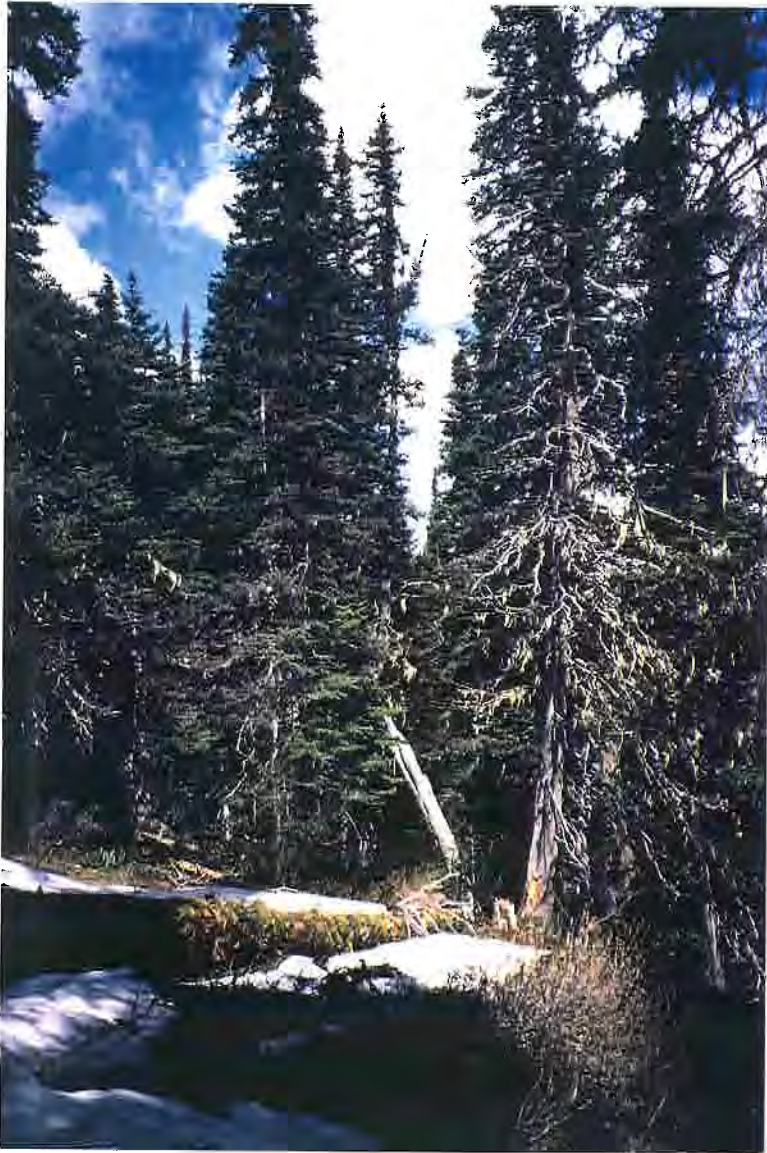
Figure 8. Upper elevation ESSF forest exhibiting small scale gap processes. Pure subalpine fir.