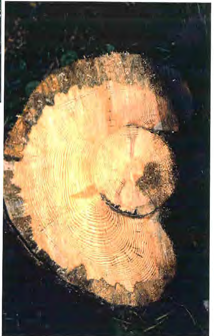
Figure 5. Fire-scarred lodgepole pine near Unna Lake. The scar dated to 1906 but the fire was likely in 1905, when the tree was 35 years old. In the ICH zone.