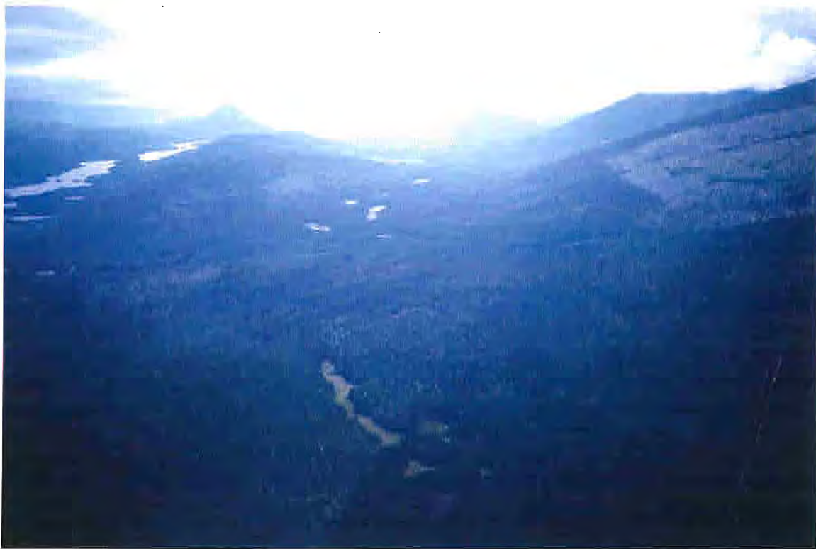
Figure 3. View north down the lower reaches of the Bowron River. Showing complex of fire patterns in the SBS. Top fire of 1971 is to the right, Spectacle Lakes to the left.