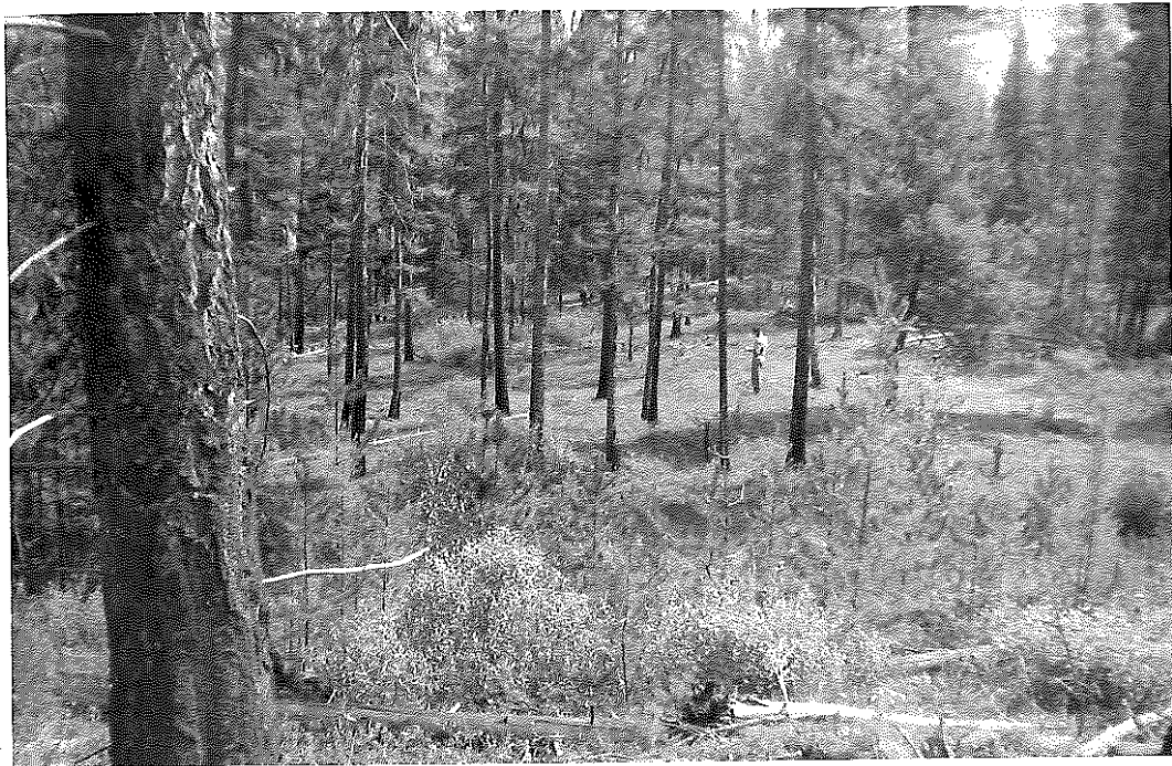
General view over proposed public reserve

The most suitable section of the lakeside for a public reserve lies at the north-west end of the lake. The ground slopes quite gently up from the lake over an extensive area on which tamarac, fir and spruce form an open and pleasant cover. The lakeshore is generally good although reediness prevails. Not much scrub willow and poplar fringe the lake although it is thick elsewhere around the shore.