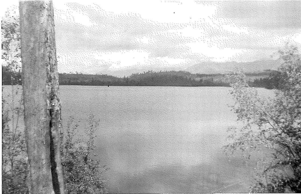
General view of lake from south-west shore looking east towards Rocky Mountains.