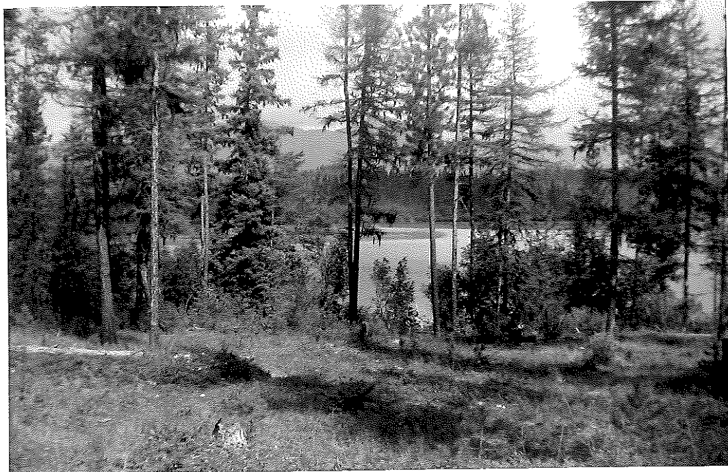
Proposed reserve backshore and lake frontage. Looking across lake with north end showing to the left.

The east side of the lake is pleasant but the topography is a little steep for purposes of a public reserve. It would be suitable for summer homes.