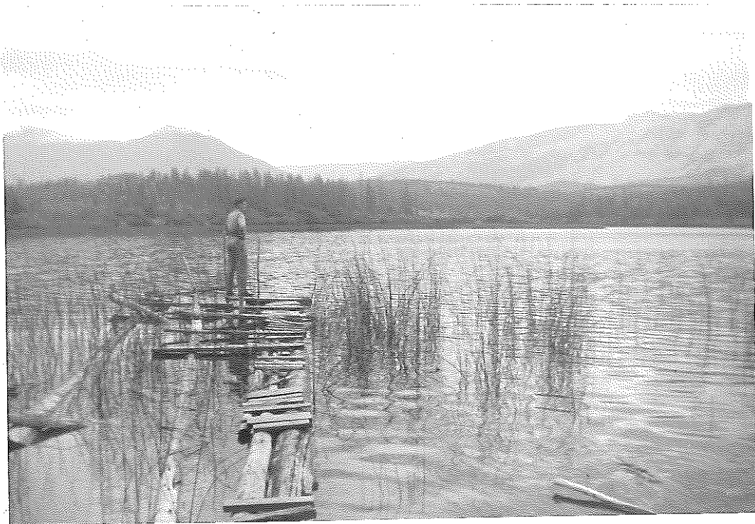
View of northern end of lake from proposed public reserve shoreline

interested in starting a fur farm on its shores. He dropped the idea stating the water was too acidic due to the very large numbers of logs covering the lake bottom. This could possibly be true although no logs are evident today. The surrounding country was logged over around 1903 and evidences of an abandoned railroad grade can still be seen near the south end of the lake on the eastern shore.