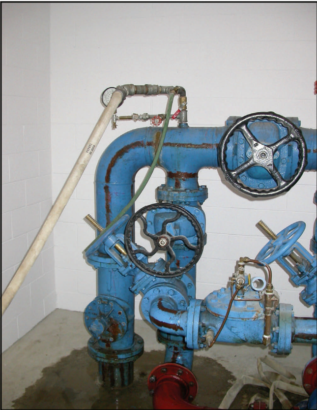
Plate 2. The raw water tap within the Fort St. James pump house.

The 2002/03 bacterial data are summarised in Table 6. Drinking water quality guidelines for E. coli , Enterococci and fecal coliforms are all 0 CFU/100mL in