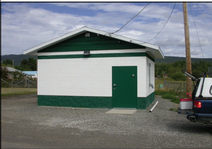
Plate 1. A view of the Fort St. James pump house where the raw water samples were collected.

This brief report will summarise water quality data collected from the Fort St. James raw potable water source (ground water) (Plate 1). The data are compared to current provincial drinking water quality guidelines meant to protect finished water if no treatment other than disinfection is present. This comparison should identify parameters with concentrations that represent a risk to human health. It is intended that this program will lead to the identification of human activities responsible for unacceptable source water quality, and that it will assist water managers to develop measures to improve raw water quality where needed.