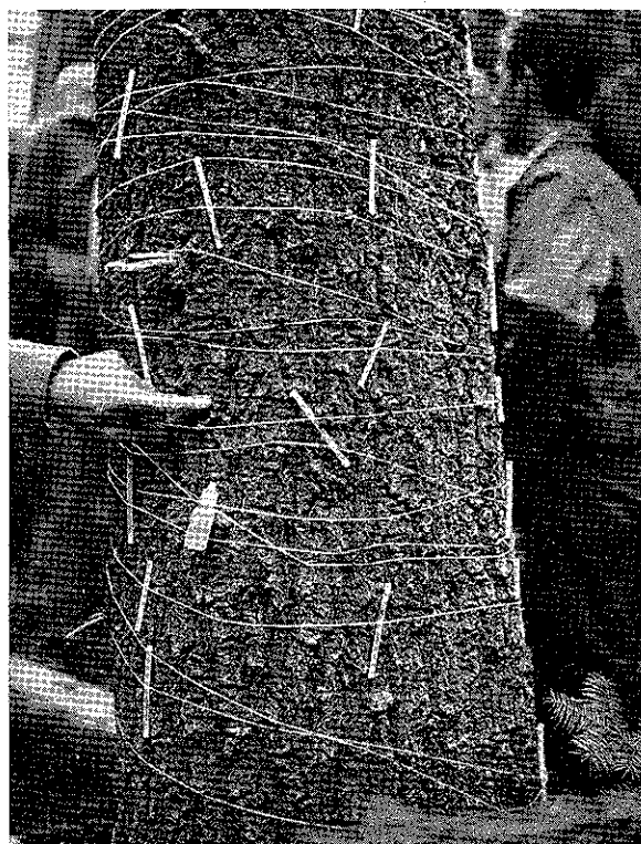
FIG. 3.—White pine tree baited with 200 ft of small-bore polyethylene tubing charged with trans -verbenol and alpha-pinene. Larger tubes and bottle contained alpha-pinene.

In the manipulation study near Lightning Point, living trees were used to trap the responding beetles, i.e. they entered and colonized the tree. If a bark beetle management program were to incorporate this approach, it must be emphasized that follow-up measures to decimate the brood and parent adults must be taken prior to emergence. Spraying with lindane prior to baiting does not seem effective in