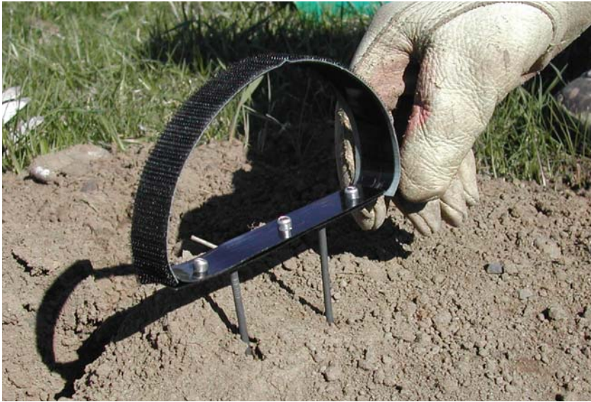
Figure 2. Velcro hair snag used to collect hair from badgers. Snags were placed inside the burrow entrance to comb animals entering and exiting burrows.

3 inch nails were inserted through holes drilled at the base of the 'D' and were used to secure the snag inside the burrow. Three rivets were placed at each edge and middle to secure the strapping in its shape. The 'hook' side of adhesive Velcro (2 cm wide) was placed along the arc to capture hair.