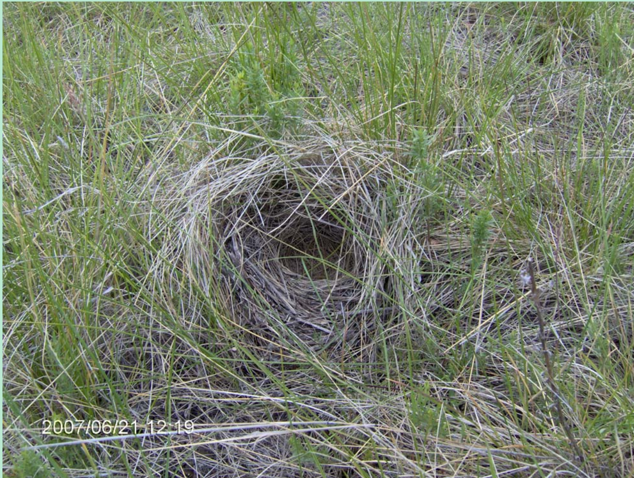
Sparrow nest