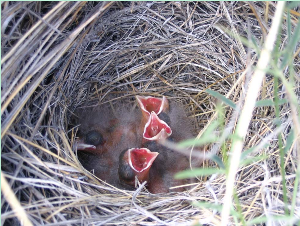
Vesper Sparrow chicks, Photo provided by Pat Robinson