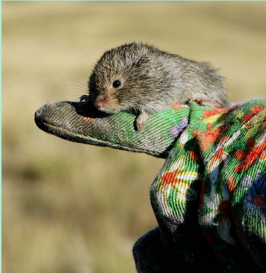
Montane Vole, Photo provided by Gerad Hales