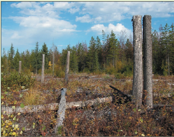
Stubbing of CMTs along cultural trail