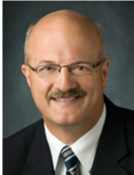
Honourable Pat Bell Minister of Forests, Mines and Lands