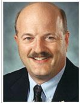
Honourable Pat Bell Minister of Forests and Range